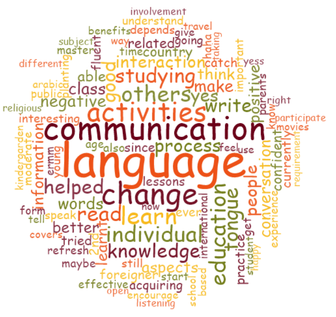
Fig. 1. Most used words in the interview sessions

From the results of the interview sessions, we manage to identify the most frequent words that were used by all respondents.