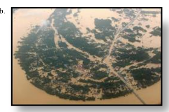
Fig 2. (a) and (b) is the area of Kelantan flood 'Yellow Colored Flood' December 2014 (The Star Online, 2014)

Based on the standard of critical river levels termed by the Department of Drainage Malaysia organization was shown in Figure 3. There are 4 levels which are normal level, caution level, warning level and danger level followed by the implementation of flood forecasting and public evacuation. Caution level shows the river level exceeding the normal level and alert people to beware. The warning level alerts the public when the river level reaches to danger level and evacuation of the nearby residents prepared. Danger level is when the river level will overflow and overtops the riverbank and the evacuation of the public are executed.