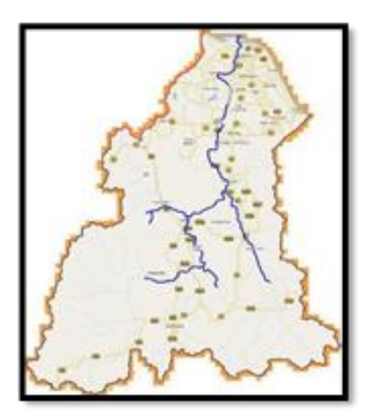
Fig 1. Map of the Kelantan rivers (Laporan Banjir Negeri Kelantan 2014)

span of 64 days. Moreover, Figure 1 shows that Kelantan Rivers was involved in more rainfall which leads flood of the downstream area of the Kelantan Rivers in December 2014.